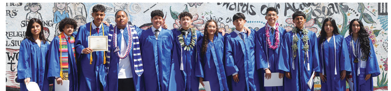
St. James School Graduates of 2024